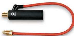
195377 50 mm Dinse-style with water return line for water-cooled torch.