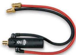
195380 50 mm Dinse-style gas thru with gas and water return lines for water-cooled torch.