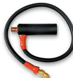
225028 50 mm thread-lock-style for water-cooled torch.