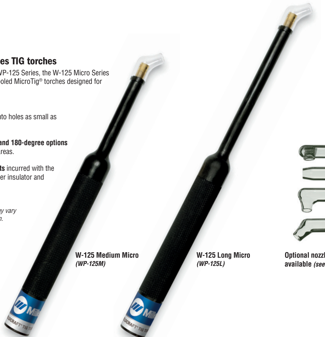
W-125 Medium Micro (WP-125M)

Note: Torches delivered may vary slightly from images shown.